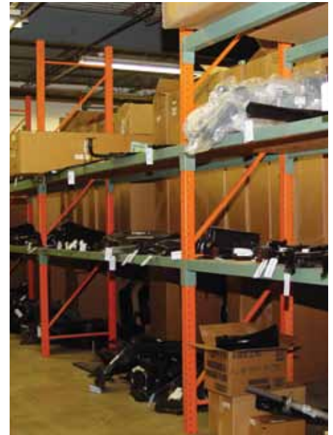
With our massive storage facility, we can stock every associated part for all your jobs.