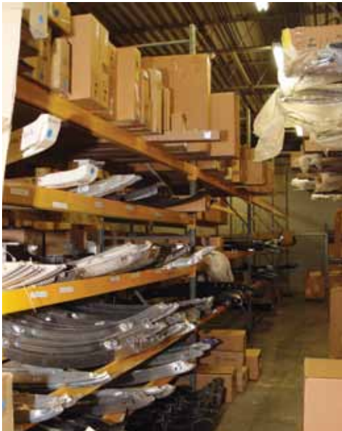
Our ongoing warehouse expansion continues to increase the number of parts for quick delivery.